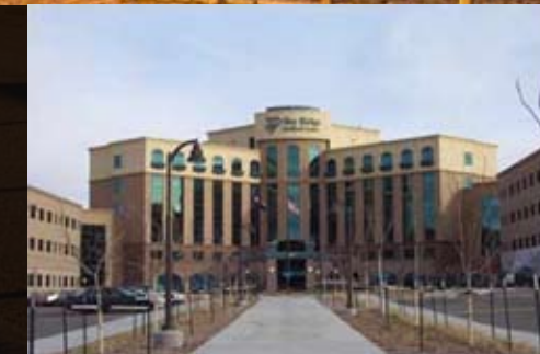
Sky Ridge Medical Center