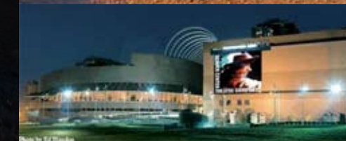
Denver Center for the Performing Arts