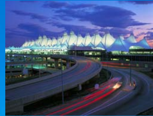
Denver International Airport